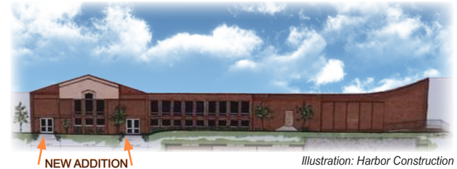
Illustration: Harbor Construction

A MULTIPURPOSE FACILITY COMING TO SOUTH FRANKFORT ~ KY A place for HOPE and RESTORATION of SPIRIT, MIND and BODY